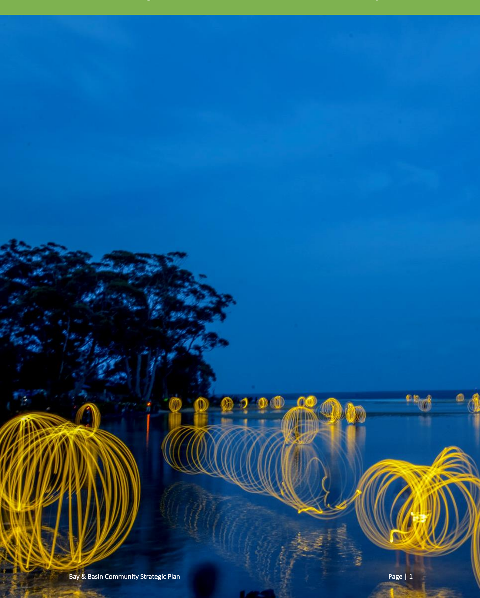
Part 1: Strategic Context – What Our Community Wants