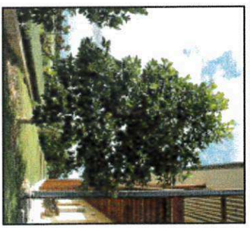
Thunbergia lustrata A native hardy tree with large silvery leaves and yellow flowers up to 4.5m high x 3.4m wide